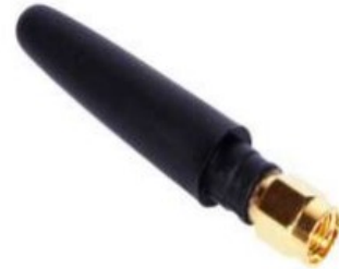
RF Antenna Pattern

This compact 2.4 GHz Omni-directional "RubberDuck" Wi-Fi antenna provides broad coverage and 2 dBi gain. It is a coaxial sleeve design with an Omni-directional pattern. It is ideally suited for IEEE 802.11b and 802.11g wireless LANs, Bluetooth® and other WLAN applications